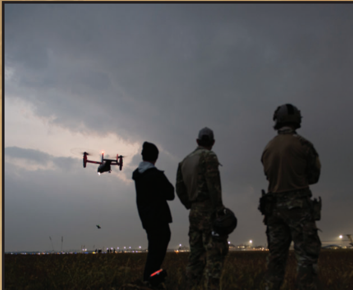
US, Japan sharpen skills during exercise Keen Sword 21 ... 12