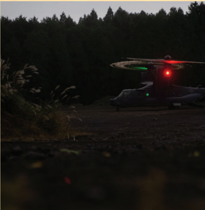
A CV-22 Osprey, assigned to the 353rd Special Operations Group, arrives at a landing zone during a search and rescue training as part of exercise Keen Sword 21, at the Combined Arms Training Center Camp Fuji, Japan, Oct. 29, 2020. U.S. service members from the U.S. Navy, Marine Corps, Army, and Air Force conducted training with their Japan Self-Defense Force counterparts from military installations throughout mainland Japan, Okinawa prefecture, and their surrounding territorial waters.

personnel jumps, and cargo inspections, uploads, and air drops.