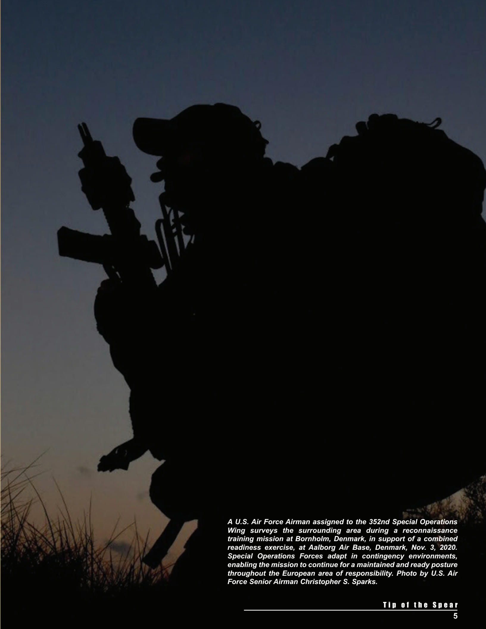
A U.S. Air Force Airman assigned to the 352nd Special Operations Wing surveys the surrounding area during a reconnaissance training mission at Bornholm, Denmark, in support of a combined readiness exercise, at Aalborg Air Base, Denmark, Nov. 3, 2020. Special Operations Forces adapt in contingency environments, enabling the mission to continue for a maintained and ready posture throughout the European area of responsibility.