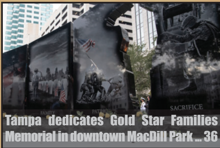
Tampa dedicates Gold Star Families Memorial in downtown MacDill Park ... 36