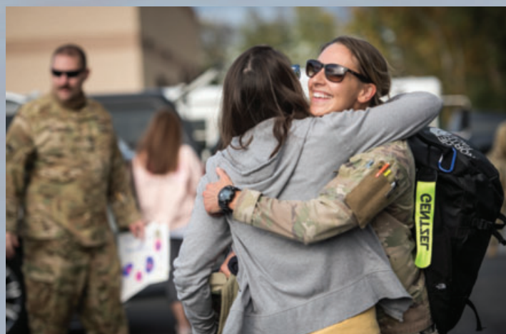
Airmen from the 193rd Special Operations Wing connect with friends, family and loved ones, Oct. 24, 2020 at the 193rd SOW in Middletown, Pennsylvania. Nineteen 193rd SOW Airmen returned home onboard the unit’s EC130J Commando Solo aircraft after completing a deployment overseas.