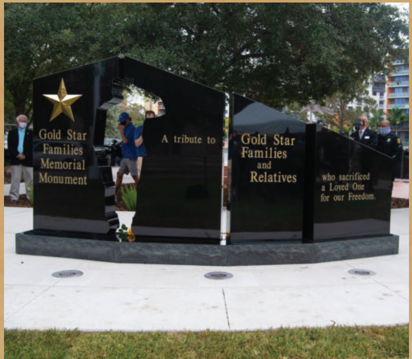
(Left) A Gold Star Family member lays a rose at the Gold Star Families Memorial at MacDill Park in downtown Tampa Nov. 7, 2020. (Above) The back of the Gold Star Families Memorial located at MacDill Park in downtown Tampa. (Below) The front of the Gold Star Families Memorial located at MacDill Park in downtown Tampa.