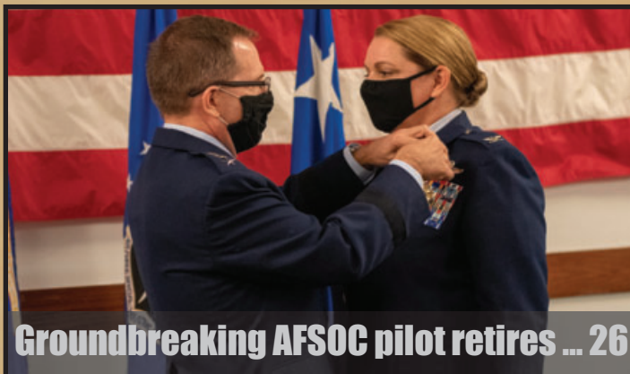
Groundbreaking AFSOC pilot retires ... 26