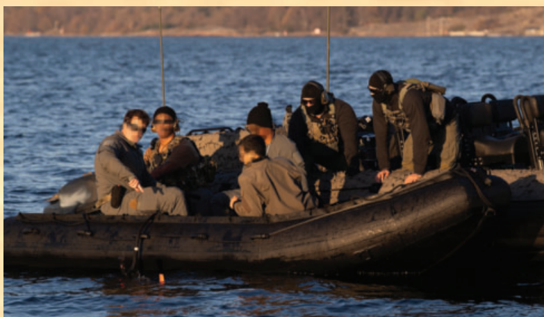
Swedish Special Forces together with U.S. Navy Special Warfare Combatant-craft Crewman and Special Reconnaissance Unmanned Underwater Vehicle operators assigned to Naval Special Warfare Command perform UUV launch and recovery training utilizing a Combatant Craft Medium in the Baltic Sea near Karlskrona, Sweden during a bilateral exercise on Nov. 6, 2020.

“This exercise provides the opportunity to train with SOF partners as well as U.S. and Swedish conventional forces across all warfighting functions and domains. This allows us to train how we will fight, while also highlighting the credibility and capability of our combined forces,” said JSOTF commander of the exercise, Col.