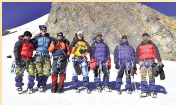
Two 1st Battalion, 1st Special Forces Group (Airborne) Green Berets stand along with their course mates and instructors atop Thorang Peak during the culminating exercise for Nepali Army's High Altitude and Mountain Warfare School in Nepal, October 2020.

1st SFG (A) remains committed to readiness for conflict, relentless pursuit of excellence, and engaging with partners across the theater wherever opportunity exists, no matter the obstacles.