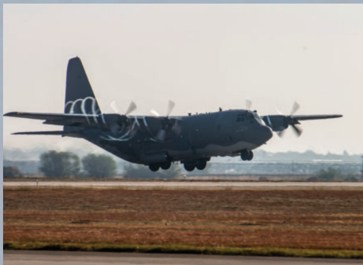
An AC-130W Stinger II gunship, Tail No. 1303, takes off on the runway at Cannon Air Force Base, N.M., for its final flight prior to retirement Oct. 19, 2020. As a gunship, Tail No. 1303 made its claim to fame by being the first gunship to record a combat kill on Feb. 9, 2011. It then went on to achieve another milestone by having the distinction of being the first 105mm cannon-installed whiskey to confirm a 105mm kill in December of 2016.